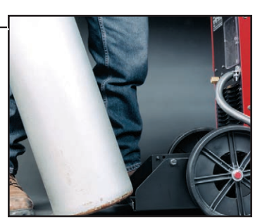
Easy Load Gas Cylinder Platform