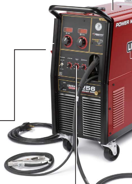
Additional Gas Solenoid - Controls Gas Flow to a Spool Gun