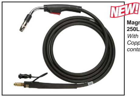
Magnum® PRO 250L Gun With long lasting Copper Plus™ contact tips

Adds 4-step trigger interlock, spot mode, adjustable run-in speed for smoother arc starting, and adjustable burnback time to minimize wire sticking in puddle.