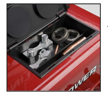
Gun Expendable Parts Compartment