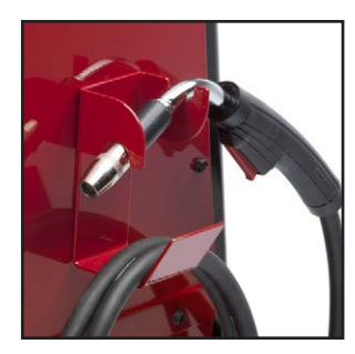
Keeps your workstation organized